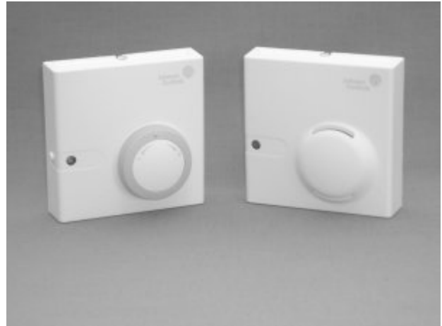
Figure 1: TE-6800 Series Temperature Sensors

Depending on the model chosen, the wires connecting the sensor to the controller can be terminated using a screw terminal block or modular jack connection, offering wiring flexibility. All models include a Zone Bus access port for connecting accessories to access the 6-pin modular jack. This feature allows a technician to commission or service the controller via the sensor.